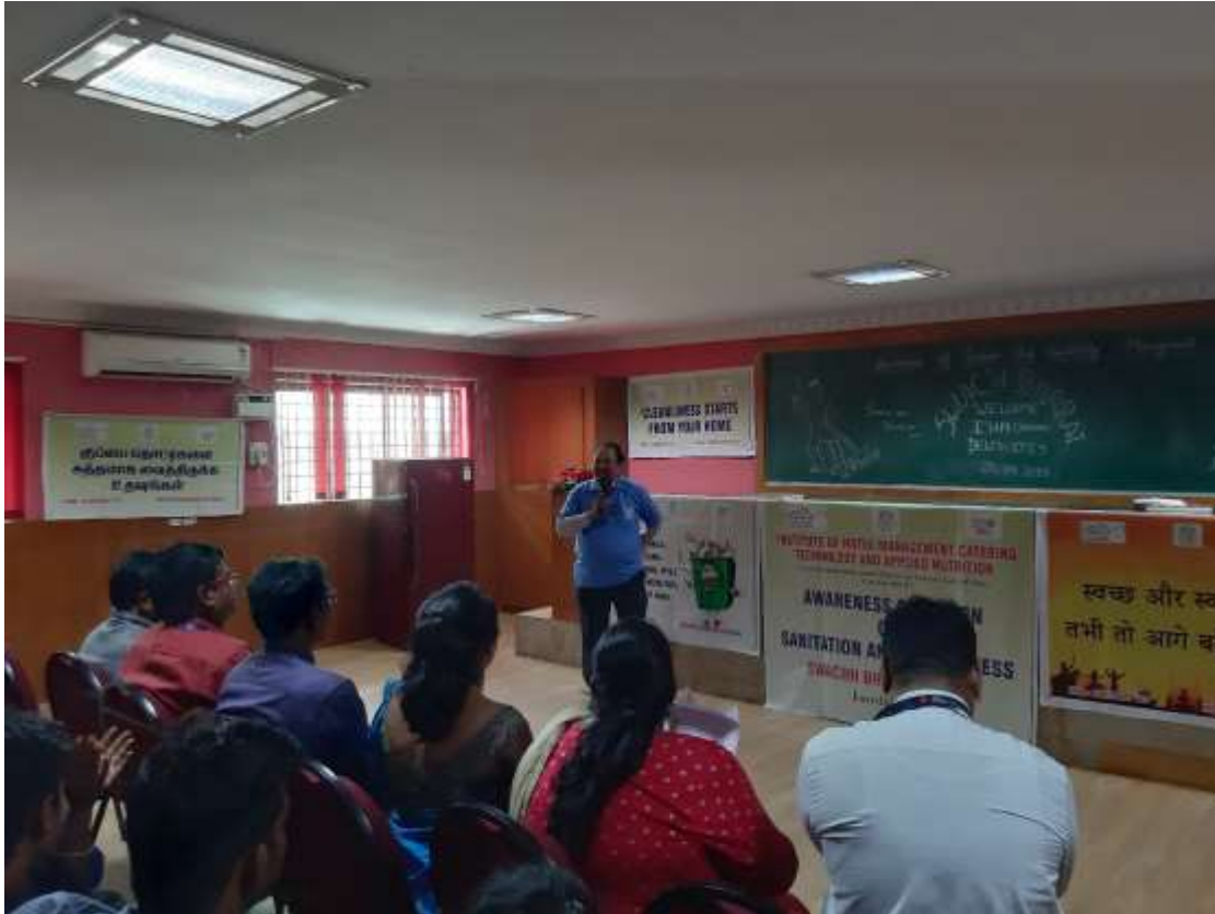
Poster Presentation by student

Followed by this the THM and IHM Chennai students went to Godhavri Mens hostel and cleaned the premises.