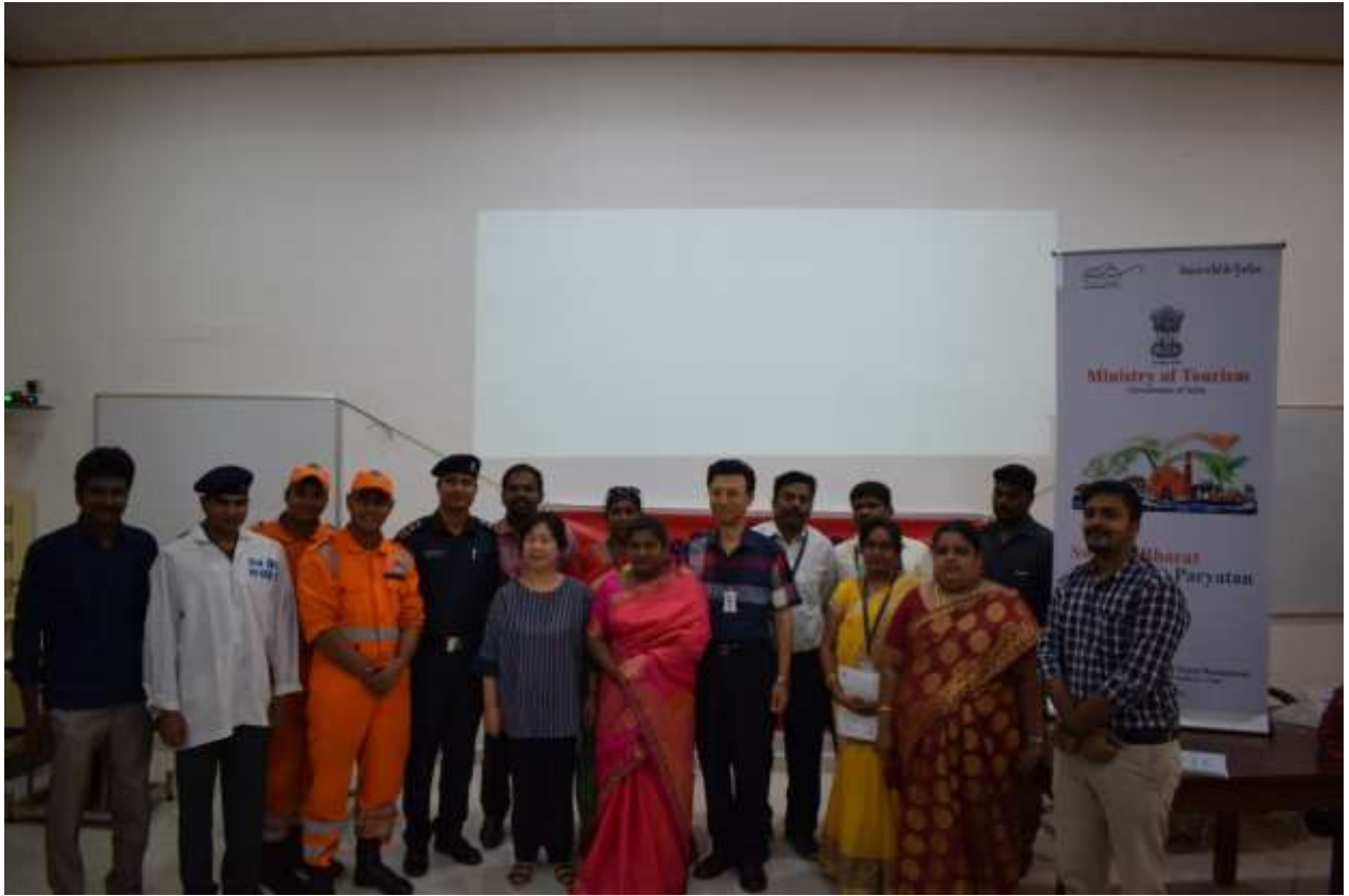
MCC Seminar .

9. Teachers day was celebrated in the Training Restaurant by the students on 5 th September.