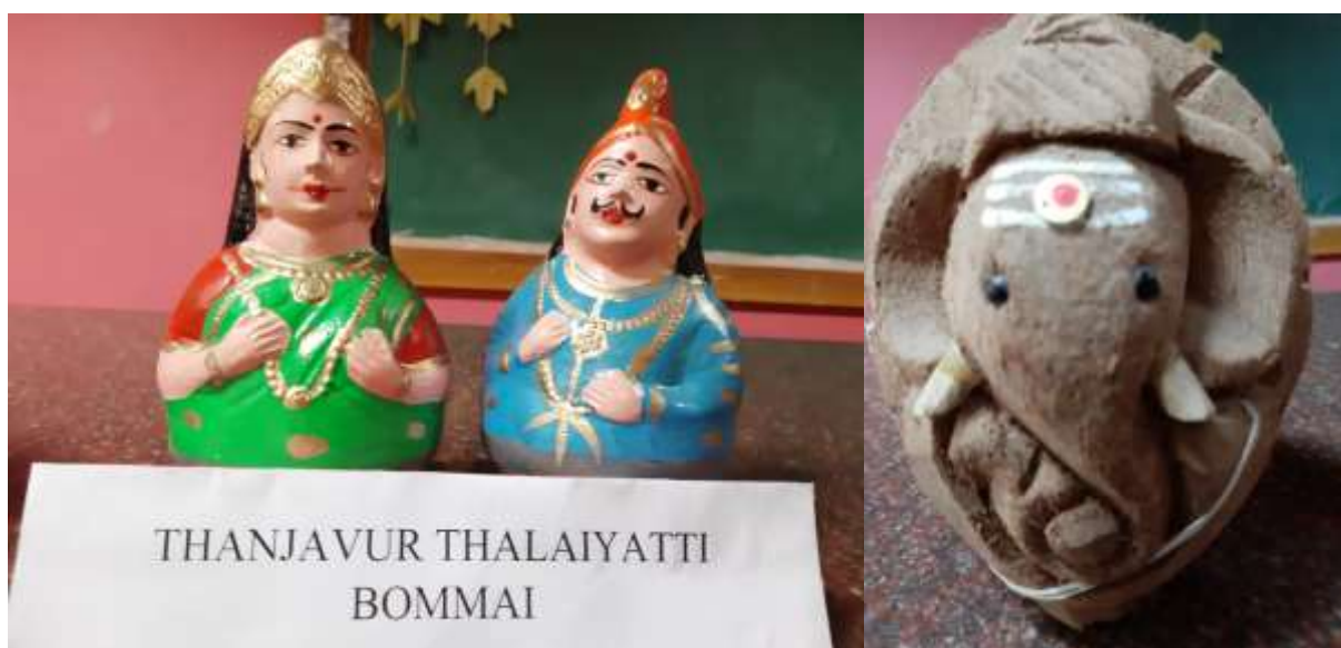
Photo session followed. Overall this World Tourism day was a grand success